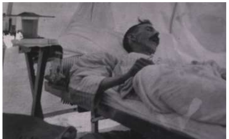
Yellow fever patient in a field hospital in Cuba.

In response to this public outrage, the AMEDD investigated infectious diseases such as typhoid and yellow fever. These boards used the knowledge gained in the bacteriological revolution to shed new light on epidemic disease control and provide greater legitimacy to physicians calling for preventive hygienic measures. Although the most boards had little impact until after the war had ended, it was the exigencies of war, coupled with the rapidly advancing medical knowledge that precipitated their creation. The most famous was the Yellow Fever Board led by Major Walter Reed along with James Carroll, Jesse W. Lazear, and Aristides Agramonte. Motivated by the high incidence of yellow fever among troops in occupied Cuba, this board successfully investigated the disease, its etiology, and mode of transmission. In discovering the disease vector to be mosquitoes, Walter Reed and his team disproved the conventional wisdom that this disease was conveyed by fomites (infected non-living objects such as clothing and bedding). Major William Gorgas (chief sanitary officer of Havana) then took immediate action and carried out a mosquito eradication program that would later be recreated and reused throughout the southern United States as well as internationally—most famously in the Panama Canal.