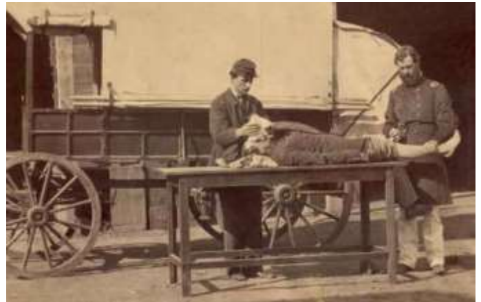
Anesthesia in the Civil War.

The American Civil War witnessed the further development of field hospitals and the acceptance, often grudging, especially among southern surgeons, of female nurses tending to savaged male bodies. Hospital-based training programs for nurses were a product of wartime experience. Civil War surgeons themselves broached the idea shortly after the peace, and the first such programs opened in New York, Boston, and New Haven hospitals in 1873. The dawning appreciation of the relationship between sanitation and prevention of infection, which would blossom into the “sanitary science” of the 1870s and 1880s, was another Civil War legacy.