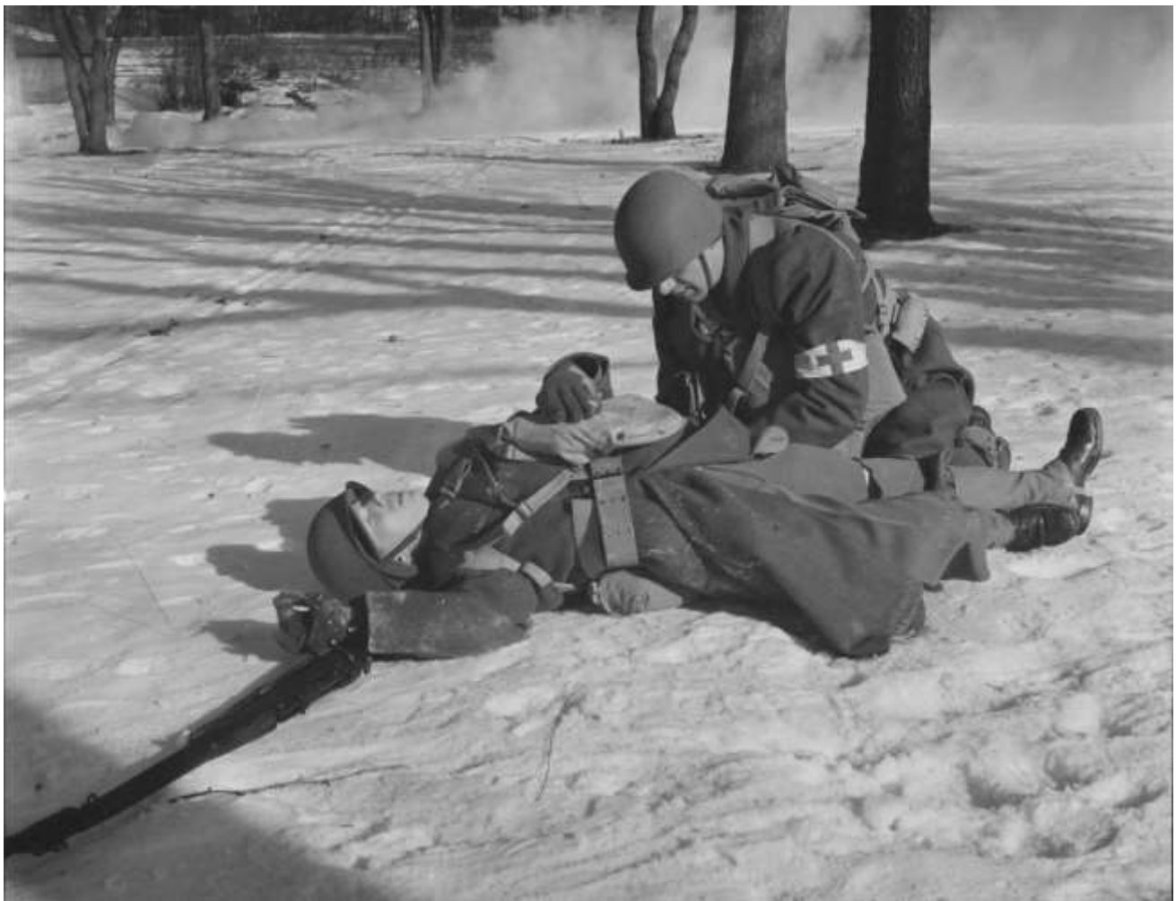
Demonstration of first aid methods at the Medical Field Service School, Carlisle Barracks, PA, February 1943.