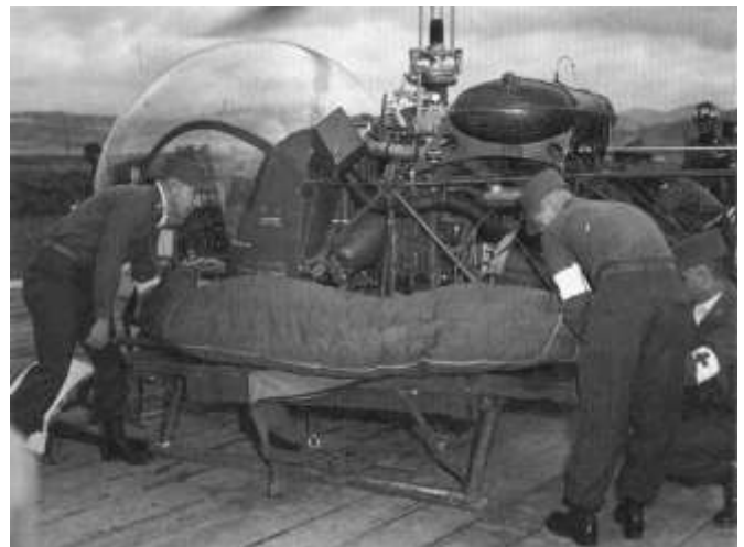
A patient evacuated by helicopter, Korean War.

By late fall of 1950, with support received all the way up the chain of command, including Gen. Douglas MacArthur and The Surgeon General, Dovell's efforts to acquire Army helicopters under his control got results. In January 1951, four helicopter detachments arrived in country for assignment to the 8th Army Surgeon with three actually being used for air evacuation. Each helicopter, an H-13 Sioux, was rigged with two exterior pods for litter patients mounted on the skids. Initially Stokes litters were used and modified, including covers locally fabricated to protect patients from the elements. Hearing that transport in such litter pods was claustrophobic, Dovell himself had himself flown in one, again to Pusan. He was quoted as saying, "By the time I got to Pusan, I was wringing wet and I'm not a fearful individual as my record will show." He further commented that the flight experience was probably the most frightening experience of his life. He then directed that medics would sedate all patients evacuated in this manner.