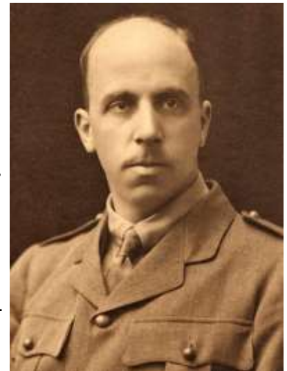
Sir Harold Gillies.