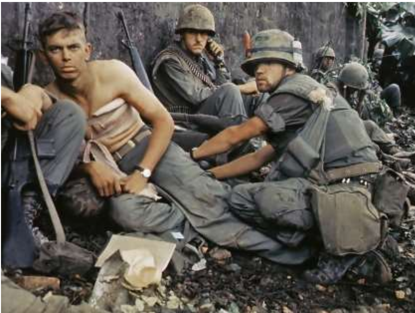
A medic at work in Vietnam.

The drum roll hardly ends with World War II. Korea gave us the first air evacuation service via helicopter, mobile surgical (MASH) units, and routine vascular surgery. Vietnam gave us Huey helicopters that could evacuate 6-9 wounded soldiers at a time (versus 1-2 in the light helicopters of the Korean War). Prior to