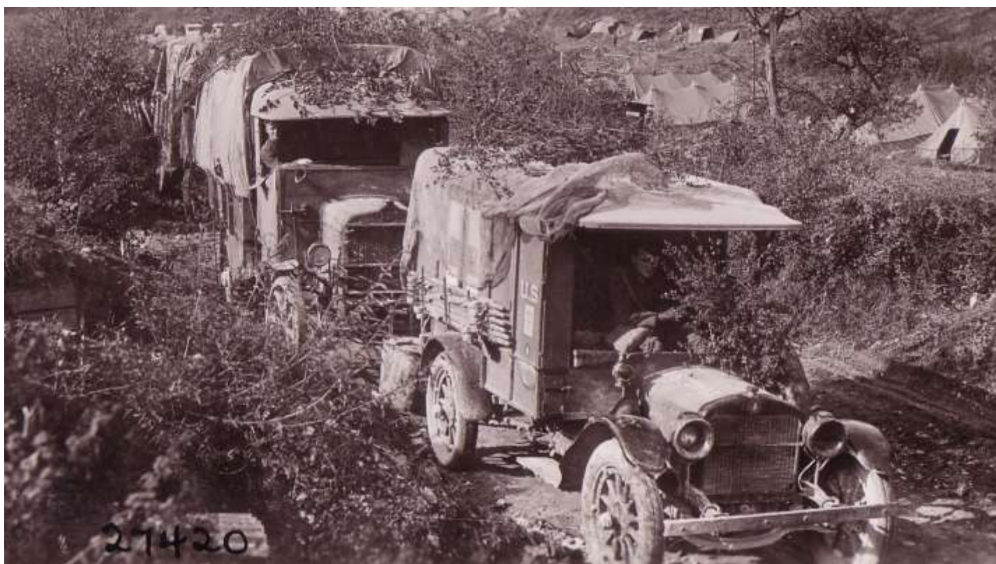
Ambulance Company No.13, 1st Division, on the move, 3 October 1918. In WWI, each division had four organic ambulance companies and four field hospitals.