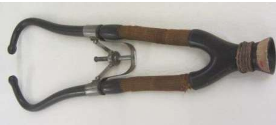
Dennison pattern stethoscope featuring binaural earpieces and flexible tubes attached to a gutta-percha bell, circa 1885.

By the 20th Century, further developments led to instruments with diaphragms to hear more minute heart sounds, often coupled with a bell to hear lung sounds. Improvements in rubber tubing provided better transmission of sounds.