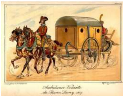
Ambulance Volante de Baron Larrey, 1807

Nor are these medical and surgical gifts limited to the era of modern warfare. The French army surgeon Jean Louis Petit invented the screw tourniquet in 1718; it made possible leg amputation above the knee. The Napoleonic Wars of the early nineteenth century brought us the first field hospitals