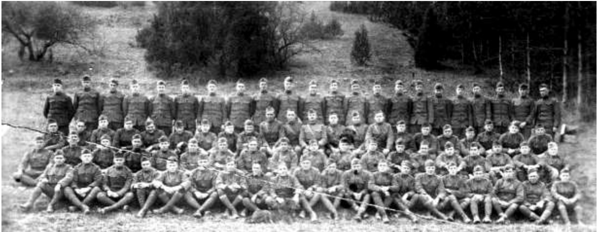
The 318th in France.

This book, based on stories written by the soldiers, will help you see their journey to and back from war.