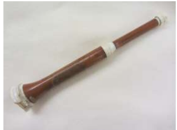
Early Piorry stethoscope from the 1830s made of turned wood with bone or ivory fittings.

Meanwhile, other researchers were developing a binaural stethoscope for better resolution of chest sounds. Early attempts proved unwieldy and rather fragile. By 1852, George Camman designed a binaural stethoscope with a hinged crosspiece to help fit the earpieces to individual head sizes, which developed over the years into various forms including the recognizable spring steel spreader seen today.