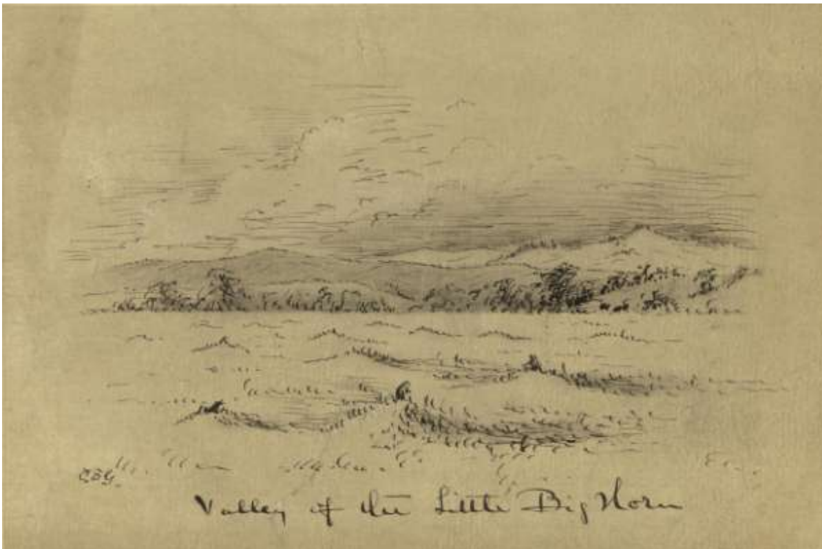
Valley of the Little Big Horn, c1880-1887.

Twelve hours later, after another fierce daylong fight on June 26, the Indian village – nearly 7,000 people – broke camp to move west and closer to the Big Horn Mountains. They were done with fighting. Reno's command took advantage of the unexpected reprieve to recover from nearly sixteen hours of relentless attack. What they didn't know at the time was that the cavalrymen led by General Custer had ridden into the thick of a fight that annihilated the battalion. On the following day, a column of soldiers under General Alfred H. Terry and Colonel John Gibbon finally arrived and rescued Major Reno and the soldiers who remained on the hilltop.