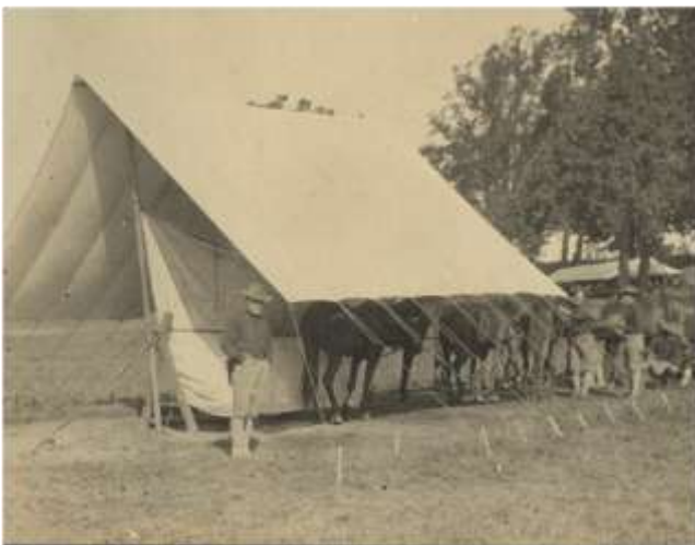
Caring for mounts and draft animals.