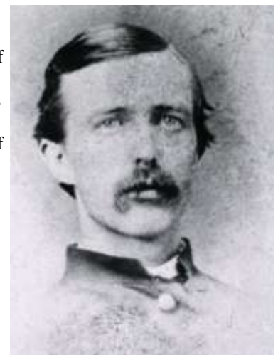
An early photograph of John S. Billings.