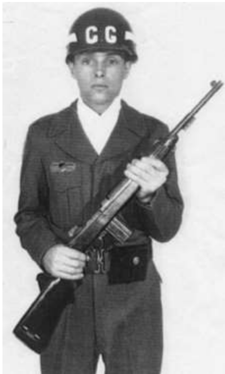
Left: a Labor Service guard with dyed US uniform and weapon

These quasi-military unit personnel lived like soldiers in barracks, and clothing and meals were provided by the US Army, but no healthcare because LS personnel were required by German law to participate in the “Social Sick Insurance Program” and received treatment from German civilian medical facilities. The LS technical unit organization included organically a physician, dentist, and the equivalent of enlisted medical soldiers. However, these