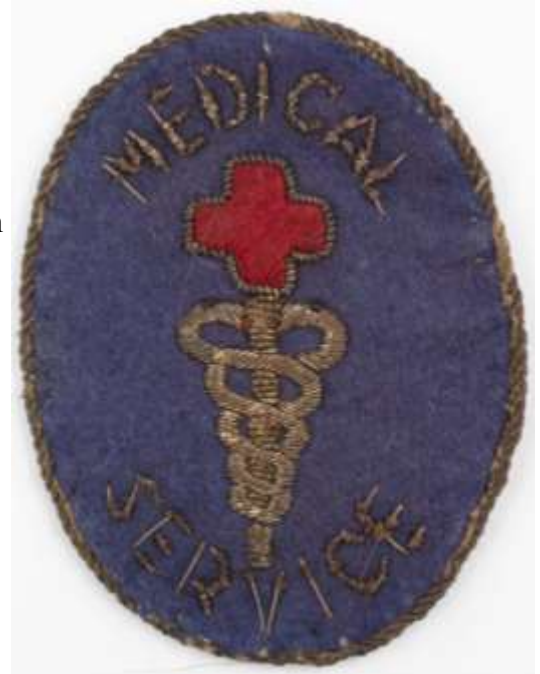
Shoulder Sleeve Insignia of the German Labor Service Medical Service