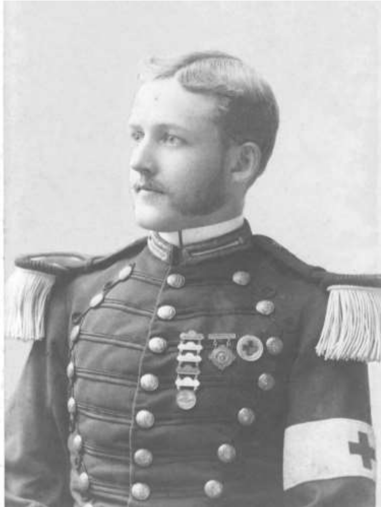
1893 image of a 71st Regiment NYNG hospital corpsman wearing a Type 1 badge.

highest numbered badge encountered (from a very small sample) was 204. This badge measures 1.44 inches from point to opposite point. The reason for the change to the Type 2 Badge is unknown; perhaps it was a matter of economy or simply a design refresh. It is also uncertain when these badges stopped being issued, although a newspaper account indicates the Type 2 badge was still being presented as late as 1902. During research for this article, no later date of issue was discovered in period newspapers, though such reports were fairly common prior to this date.