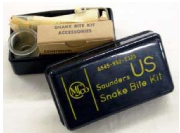
U.S. Army issued snake bite kit from the Vietnam era.

Among the highlights from personnel of the Medical Service Corps are a small group of flight uniforms from medical evacuation pilots, including a flight jacket from Major Charles Kelly, whose personal call sign “DUSTOFF” became the term to request a medical evacuation mission.