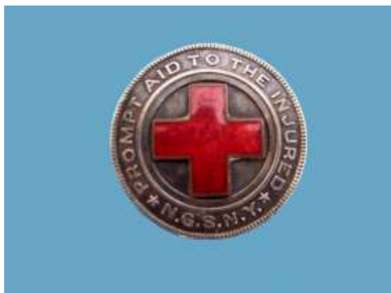
Left: Type 1 badge, front

The Type 1 badge was made of sterling silver by the firm Black, Starr & Frost of New York City and is circular, 1.25 inches in diameter. It bears a Greek cross in red enamel, with the legend * PROMPT AID TO THE INJURED * N.G.S.N.Y. surrounding the badge at the perimeter. The reverse consists of a c-catch pin and has the stamped unique serial number of that badge at the six o’clock position. The highest numbered badge the author has seen is 541 but only a handful of samples have been observed, so the actual range could be more extensive. The legend “PROMPT AID TO THE INJURED” reflected a common description for first aid services current during the period when the badge was established. While it seems stilted to the modern reader, it would have been instantly recognizable to the public in the 1880s and 1890s.