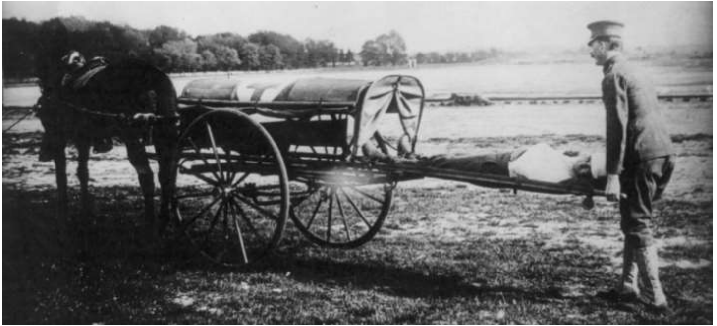
The Army has long wanted to quickly evacuate the wounded. Between 1908 (the rough date for the “gallop ambulance” above) and 1926 (when the Army Air Service became the Army Air Corps) patient opportunities for rapid patient evacuation changed remarkably. Neither of these ambulances was adopted, but research and development work proceeded in peacetime as well as wartime.