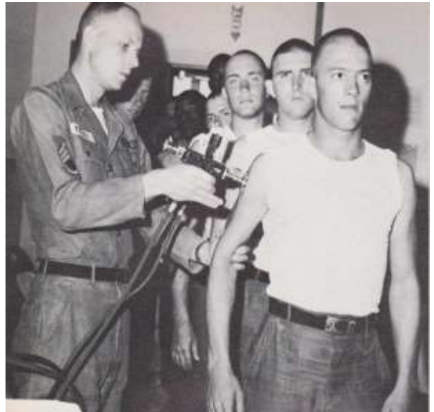
Cold War recruits receiving Ped-O-Jet injections.

https://www.youtube.com/watch?v=GmEHC04t0HA