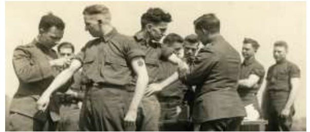
Soldiers getting their immunizations in WWI.

Since WWI the military has needed to efficiently administer immunizations, especially during the initial intake of service members. Generations of soldiers remember standing in a long line leading to a medic on each side, each armed with a syringe and needle, who administered (often none too gently) the requisite inoculations. As early as 1938, researchers began experimenting with the concept of a needle-free system for administering injections. One principle which showed promise was that of a metered, high-pressure jet stream of liquid which would penetrate the skin and muscle to an appropriate degree.