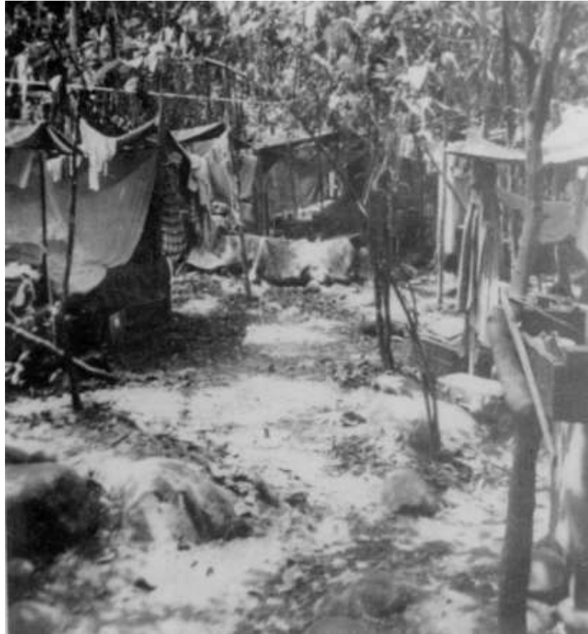
One of the outdoor ‘wards’ of Hospital No.2.

By the morning of 9 April 1942, Hospital Number One had been captured and it was obvious the Japanese would shortly capture Hospital Number Two. Most nurses were evacuated to Corregidor. Patient cen-